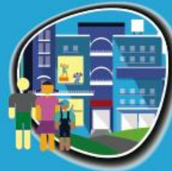
LOW INCOME HOUSING