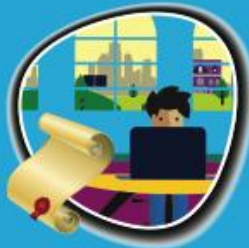
FREE SKILL TRAINING AND FREE CREDIT WITHOUT GUARANTEE