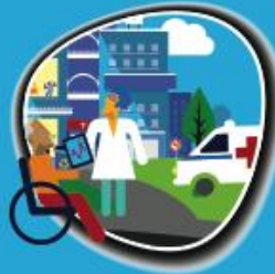
24 HOUR HEALTH CARE