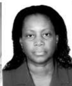
Celia Erna Cumbe Councillor for Finances. City of Maputo, Mozambique