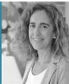
Ibone Bengoetxea Deputy Mayor. Bilbao City Council

The challenge of good governance in local administrations